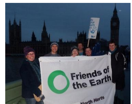
And the end!